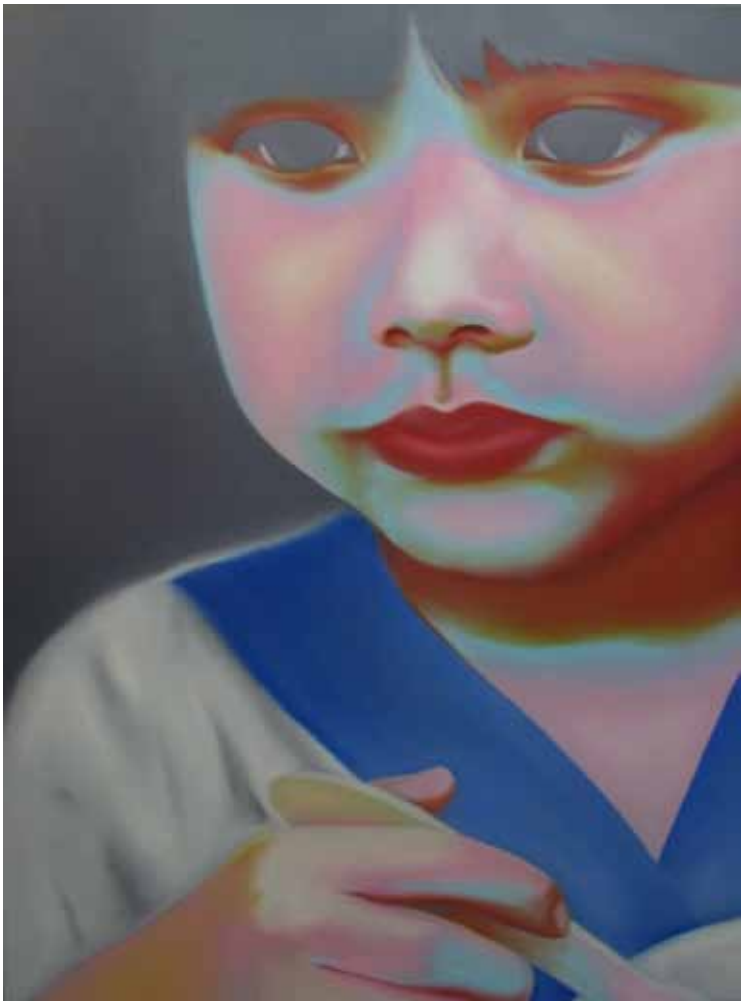
Neon VII, 90 x 120cm, Oil on Canvas