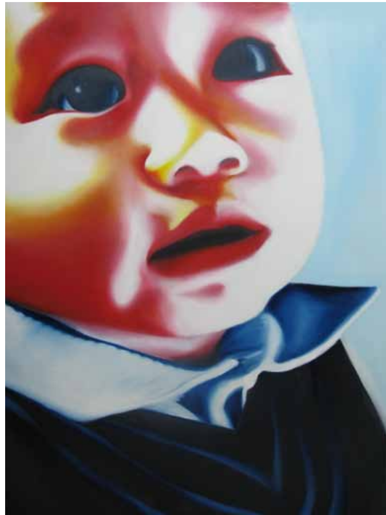
Neon VIII, 90 x 120cm, Oil on Canvas