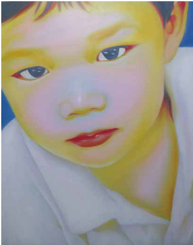
Neon XI, 120 x 150cm, Oil on Canvas