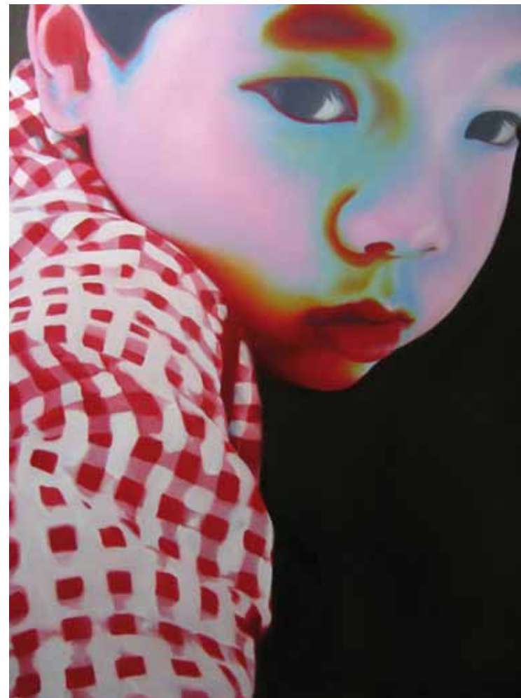
Neon VI, 90 x 120cm, Oil on Canvas

Collections Various private collections: Singapore, Korea and U.S.A.