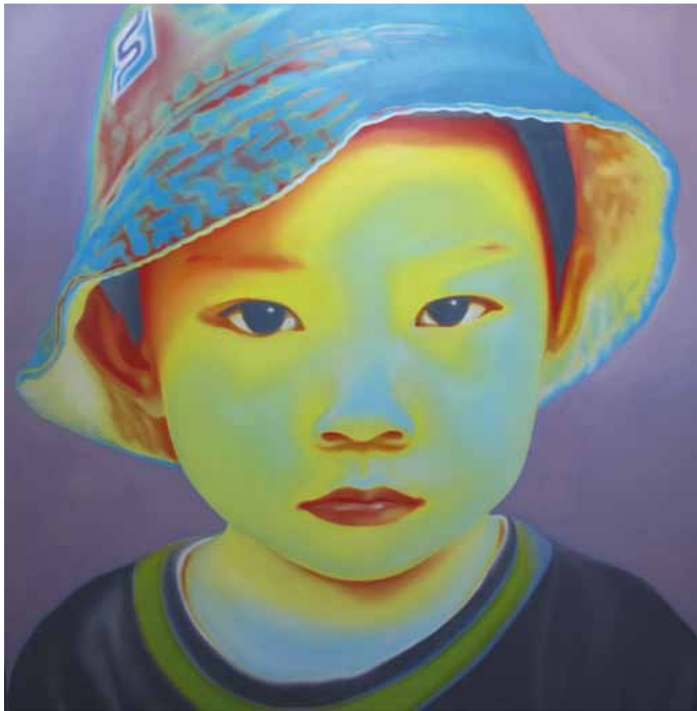
Neon X, 150 x 150cm, Oil on Canvas