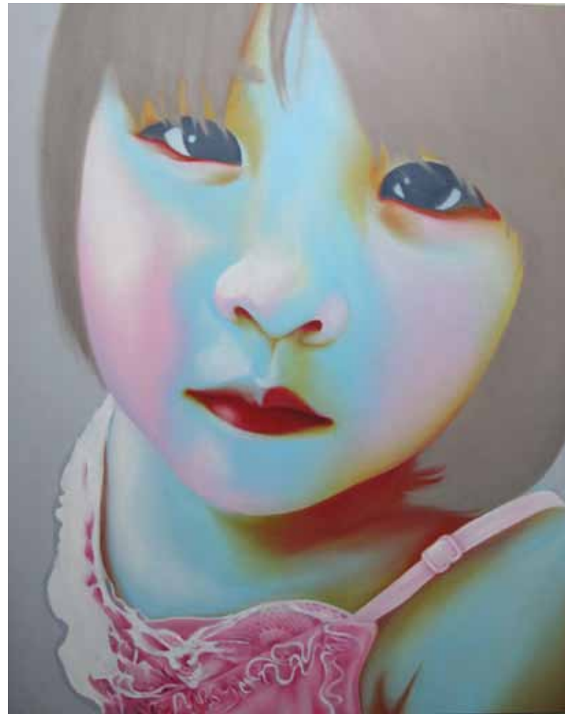
Neon IX, 120 x 150cm, Oil on Canvas