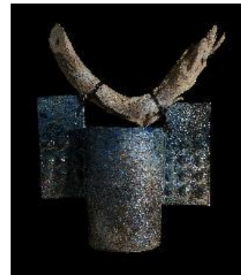
Samurai, 2018 H 38.5 x 31.5 x 13.5 cm