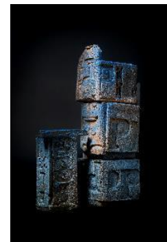
Back to Basics, 2018 H 15 x 11 x 5 cm (left) H 32 x 10 x 12 cm (right)