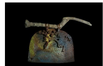
The View from Manazuru (Yokohama), 2017 H 30 x 44.5 x 13 cm