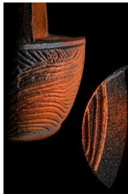
Autumn in Kyoto, 2018 H 31.5 x 32 x 21 cm