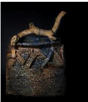
Thought versus Reality, 2018 H 56 x 41 x 14 cm