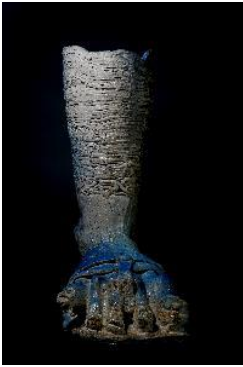
...my foot!, 2018 H 35.5 x 29 x 15.5 cm