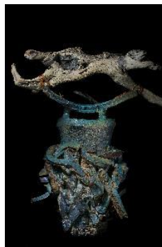
Unhinged, 2018 H 35.5 x 49 x 18 cm