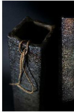
Feminine, Masculine, 2018 H 44 x 11 x 11 cm (left) H 44.5 x 11 x 11 cm (right)