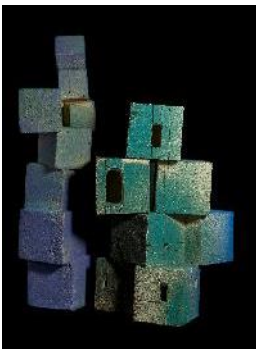
We turn the Cube and it twists us, 2018 H 33 x 23 x 19 cm (green/blue) H 44 x 14.5 x 13 cm (purple)