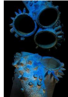
Prickly, 2017 H 22.5 x 21 x 21 cm