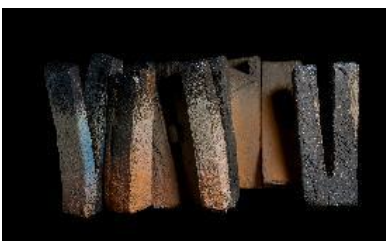
Queue and Wait, 2017 H 21.5 x 33 x 21 cm (left) H 18 x 8 x 7 cm (right)